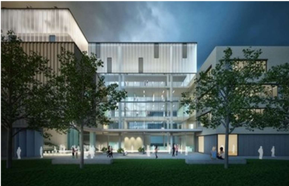
The 'East Quad' at the Grangegorman Campus

School of Social Sciences, Law and Education